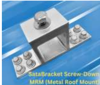
SataMount MRM Metal Roof Mount

Most standing seam, concealed fastener, floating metal roofs can NOT accept screw fasteners and will require the SataMount RCT with roof clamps. These instructions are for mounting the SataMount MRM using the SataBracket on a roof system that can accept screw down mounting