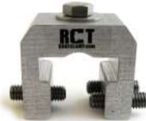
SataMount RCT Clamp For Standing Seam Metal Roofs

*Make sure all workers are properly harnessed and anchored to the roof according to OSHA fall protection guidelines.