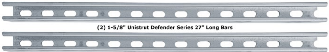
(2) 1-5/8" Unistrut Defender Series 27" Long Bars